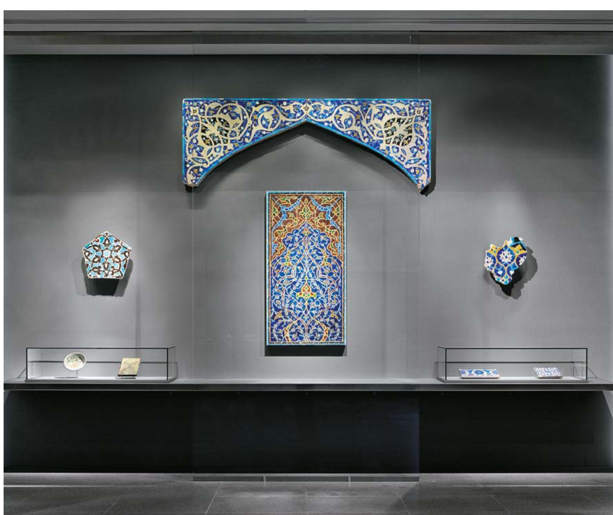
The art objects displayed in protective showcases are brilliantly highlighted by accent lighting.

No daylight enters the museum, which includes permanent and temporary exhibition rooms. The masterpieces are illuminated exclusively with artificial lighting, so the spotlights were equipped with special UV filters to protect sensitive exhibits. To facilitate automatic control, Zumtobel also added integrated actuators to 1 200 STARFLEX luminaires. In addition to lighting management, this means that each spotlight can be pivoted and swivelled by up to 45° using an intelligent control system. The 850 STARFLEX in the temporary exhibition halls have a variety of lens optics and variable distribution angles to allow targeted illumination of the exhibits.