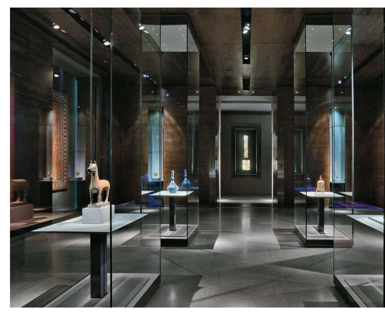
STARFLEX spotlights with fully automatic control were created for the museum in Doha.