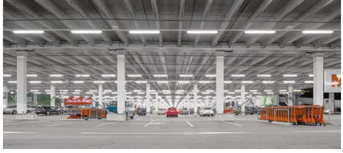
The SCUBA LED luminaire with IP 65 rating combines reliability and energy efficiency.