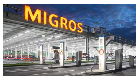
Convenience in a car park is created by spacious dimensioning of zones as well as by the illuminance level.