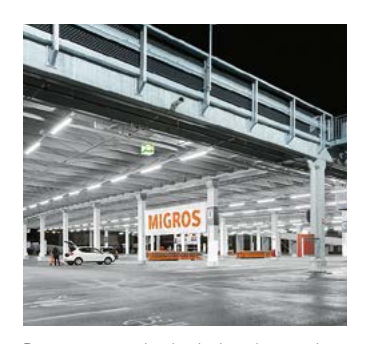
Due to escape sign luminaires that can be recognised from a long distance, the number of luminaires required has been reduced.

IP 65 protection and LED: the perfect combination for lastingly reliable luminaires in covered outdoor areas