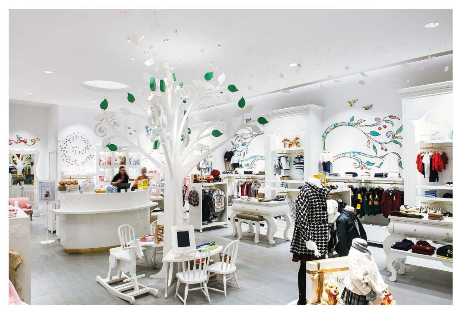
CARDAN LED and PANOS INFINITY ensure excellent efficiency and high lighting quality for the latest children's fashions.

Zumtobel MENA has played another key role in the implementation of a 100 percent LED lighting scheme in a retail application. Following the specification of a hybrid solution for the flagship Katakeet in Abu Dhabi, Zumtobel worked with local partners to achieve a splendid full LED design for the new Mall of the Emirates store in Dubai.