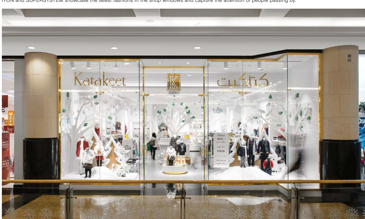
IYON and SUPERSYSTEM showcase the latest fashions in the shop windows and capture the attention of people passing by

CARDAN LED and PANOS INFINITY guarantee optimum general illumination with high uniformity and a significant improvement in colour rendering when compared with conventional sources such as metal halide. In addition, CARDAN LED can be adjusted to suit changing interior arrangements. SUPERSYSTEM is also installed in the ceiling above a decorative white tree to highlight the activity area for children. The lighting solution ensures a pleasant retail experience by helping to create a bright and welcoming atmosphere both inside and outside the store.