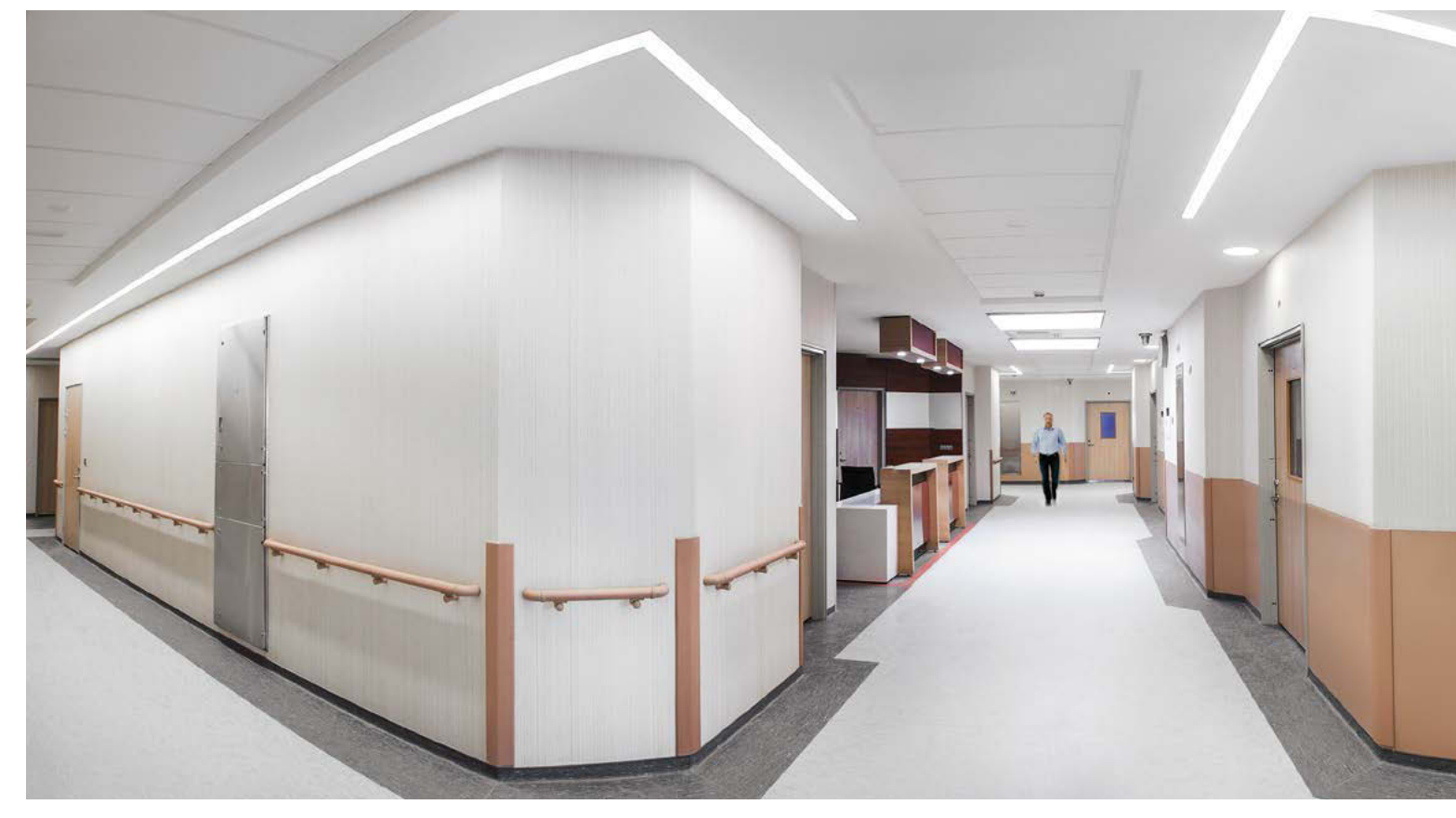
The pure light lines of SLOTLIGHT II provide pleasant general lighting for patients and staff

The Razavi Hospital is situated in the Iranian city of Mashad. The state of the art facility covers 56,000 square metres and caters for patients with a wide a range of medical conditions. Cardiac units, cosmetic surgery wards, radiology departments and fertility clinics can all be found in Razavi Hospital, which has become known around the world for a class-leading medical education programme and clinical research initiatives. The lighting design, installation and commissioning of the ambitious 35,000 square metre extension was the result of close cooperation between Zumtobel and local partners such as Pars Idea Stack.